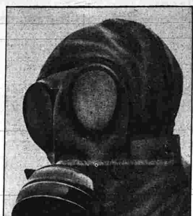
DOUBT IS TROUBLE can hold no terrors for this wearer of the "Man from Mars" hood. His aviator's helmet protects him high above the earth, while his mask safeguards him if he lands in an area of radiation.