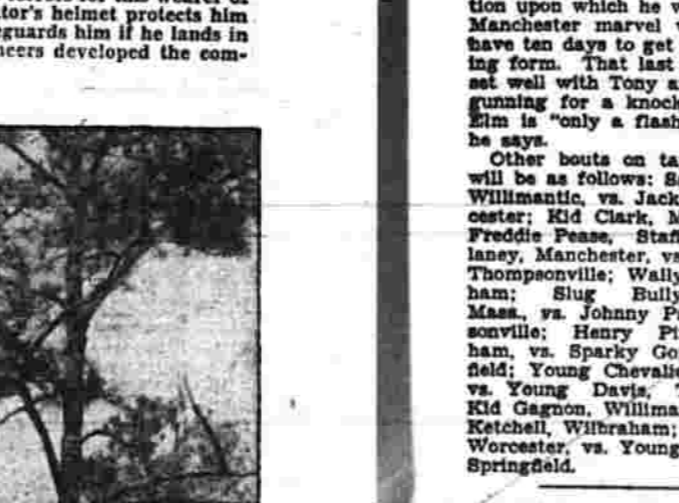
THEY WENT FOR A WALK in their sleep, little Miss Third floor. Now they're both recuperating in a cast and bandage.