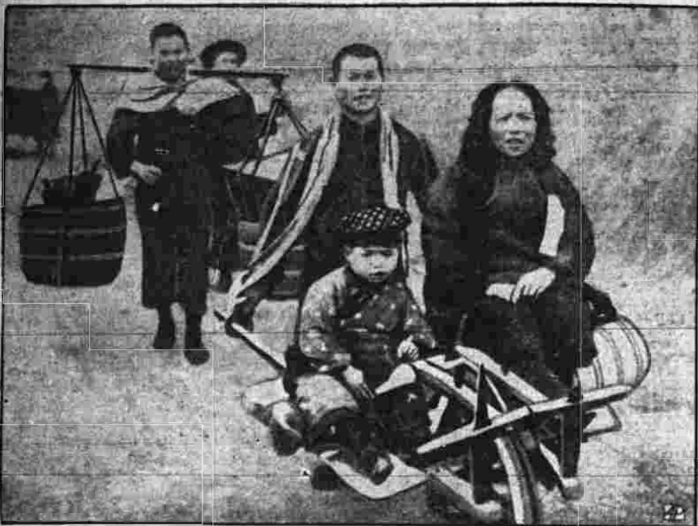
THEY FOUND NO PEACE in their North China homes as bitter conflict raged with Japanese forces, so these refugees fled, using any kind of conveyance. The passenger wheelchair has been in use in China for hundreds of years. The woman passenger, it appears, had the foresight to bring along her bed. In the rear marches a villager carrying household utensils snatched up in the hasty departure.